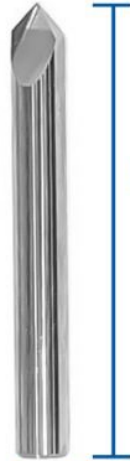
90° V-Bit Blade