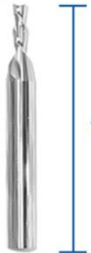
1/16" Down Cut Endmill