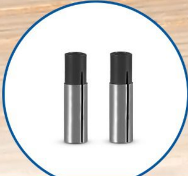
Collet Adapters speed up your bit change