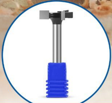
Surfacing Bit levels the spoilboard