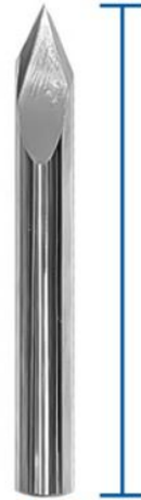
60° V-Bit Blade