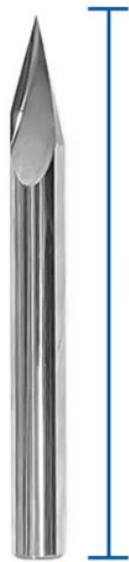
30° V-Bit Blade